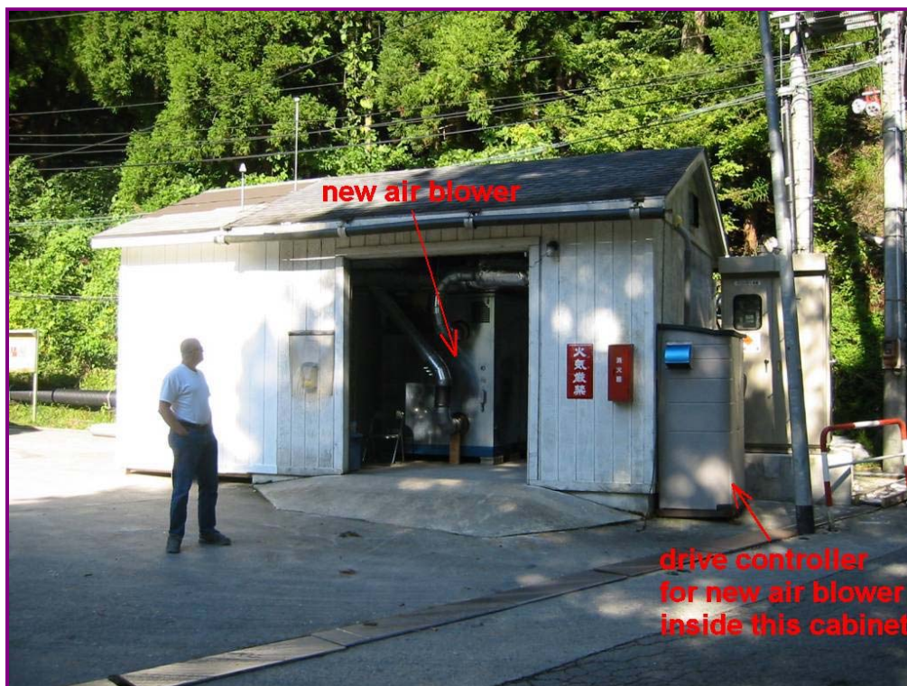
new radon hut setup (Sep. 2002)

In the summer 2002, the radon hut underwent a major reconstruction and upgrade ( photos ). A new 'main air blower' was installed with approx. 5 times more air flow capacity of the original 'service blower' (now 'spare blower #1').