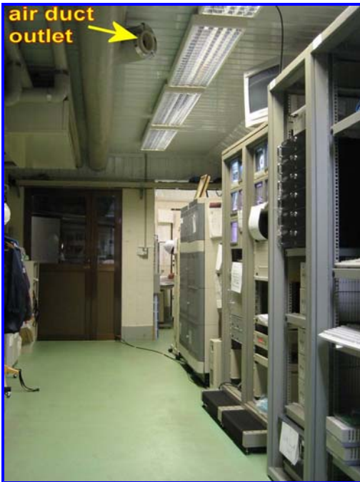
airduct outlet in SK mine control room