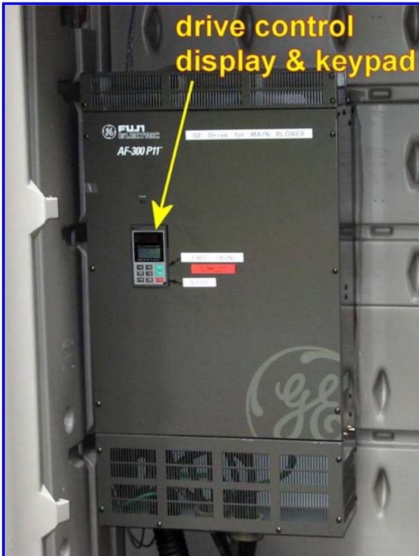
drive control panel

If you find the system stopped, then go to the grey plastic cabinet on the street side of the hut (see photo above). Open the cabinet door and you will see the control panel inside as shown below.