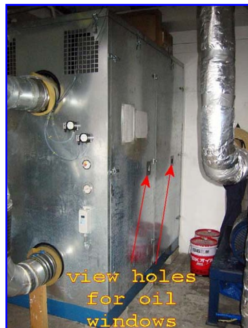
side panel of the main blower

If one of the windows (or both) show only oil below 1/4 level or even no oil (dry), then please contact an expert immediately (see below)!