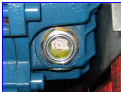
right oil window