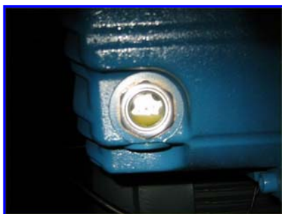
left oil window

The oil windows are located behind the right side of the large enclosure of the main blower (on left side of radon hut main room when you open the main door). Two holes were drilled in the side wall of the enclosure so you can look directly into the oil windows without opening up the enclosure.