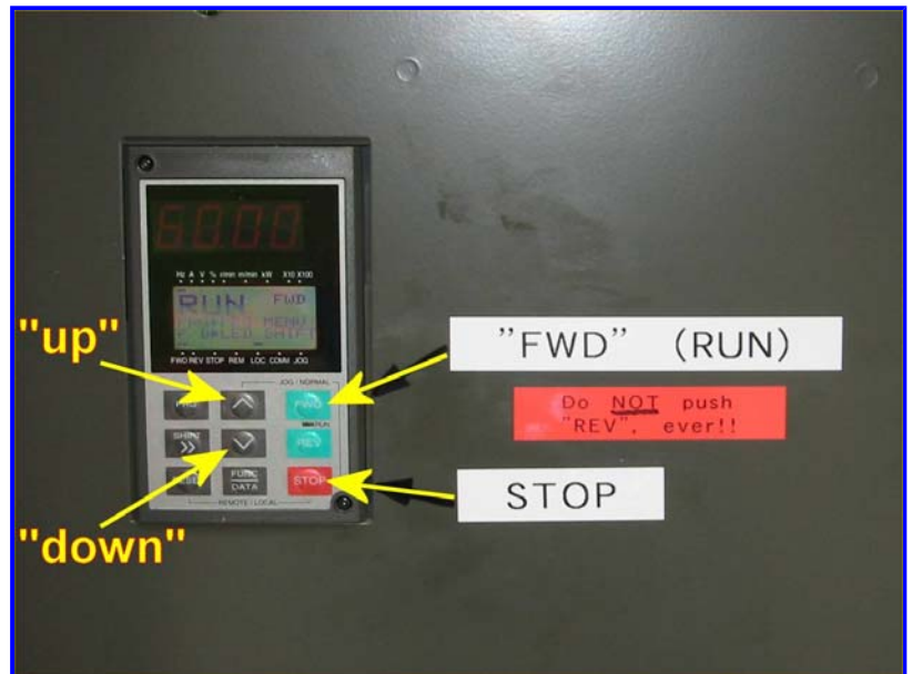
control keypad and display

Normally, the display should show "60.00" (Hz). If it shows "0000", then push and hold the "UP" key for several