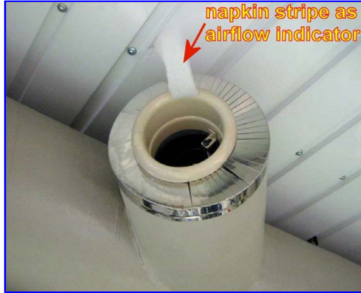
airduct outlet with napkin strip as flow indicator

Also, there is a big air duct outlet at the entrance of the SK dome right above where the access hallway ends. If the napkins are not moving, then the system is apparently off. Please contact an expert (see below)! You might be asked to go back to the radon hut and try to restart the system.