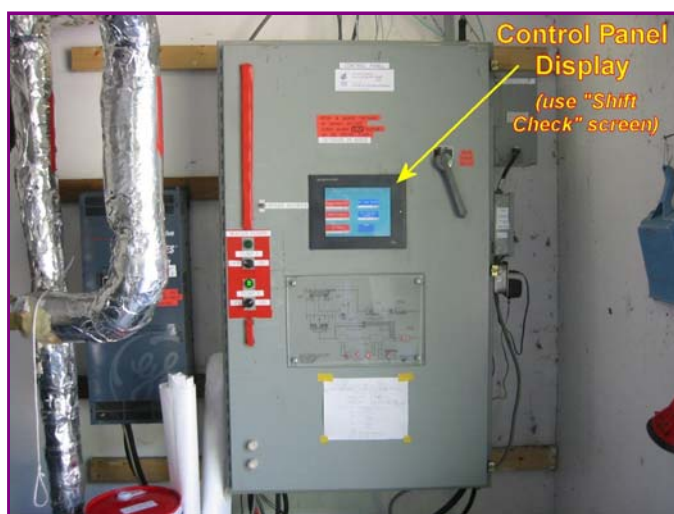
control panel touchscreen display

The flow value should be between 60 - 80 GPM (gallon per minute). If the water flow is far below 60 GPM or even stopped, please contact an expert as soon as possible.